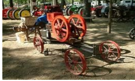
Swamp Yankee Days