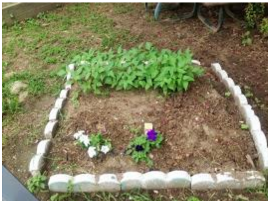
Bailey School Garden, Providence

Last summer, RI Farm to School was able to pilot summer school gardening programs in six different gardens around the state. Our Americorp VISTA, Cate Puccetti, was wildly successful in achieving the goals of our summer gardening programs. During 31 different programs, students were exposed to at least 39 different fresh fruits and vegetables (almost 180 pounds!) while learning basic gardening skills, basic food preparation and food safety skills. Cate developed a suite of interactive and engaging gardening lessons while having fun in the sun with over 130 students. Farm Fresh is thrilled to continue the program this summer in three RI communities with our USDA Farm to School funding and a new Americorp VISTA. Sarah Mosley, a Dietetics Major at URI, will continue working with students at our original pilot sites in Newport, Providence and Pawtucket, and begin a summer school gardening program in Central Falls. We are excited for Sarah to join our Farm to School team next month, and work with us through mid-August. Sarah is a Writing and Rhetoric minor, so look forward to our newsletters and blog posts getting a whole lot better this summer!