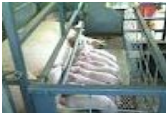
Farrowing Crates Protect Little Pigs

using gestation crates or veal crates, but several farmers are using farrowing crates. Farm Bureau is against this bill in its current form. This bill has passed the House but has not even been assigned to a committee in the Senate as this newsletter is being written.